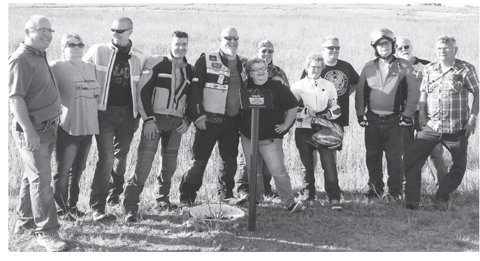
Above the Dutch Route 66 Association with Galena City Officials and local business owners.

Right: The plaque that was dedicated to the group for planting 10 or more trees in a beautification effort for Route 66 through Galena.