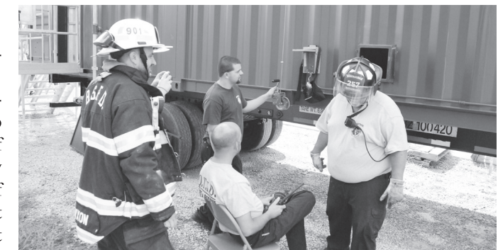
Above: Trainers sit outside the burn trailer with monitors and an open view to watch the trainees go through the session. A temperature gauge makes certain that it is not too hot for the firefighters in the session.